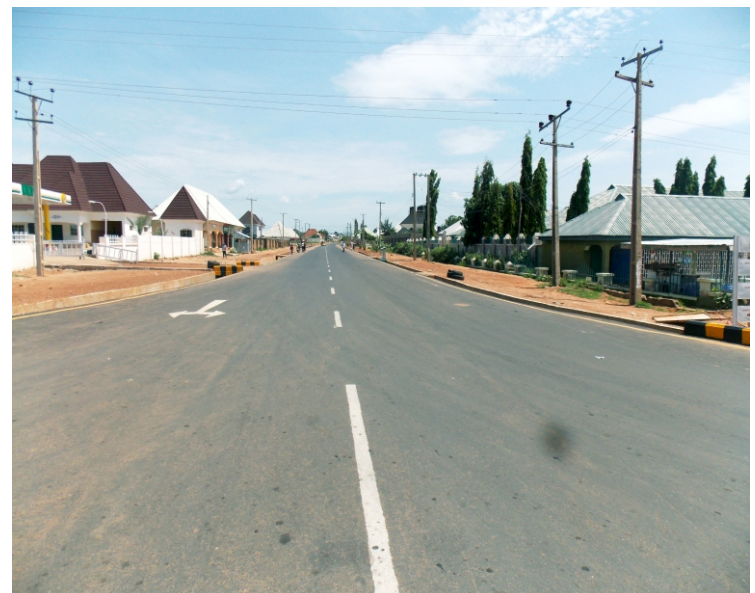
DOCTOR'S QUATERS ROAD AFTER