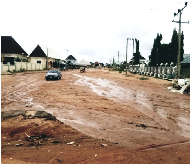
DOCTOR'S QUATERS ROAD BEFORE