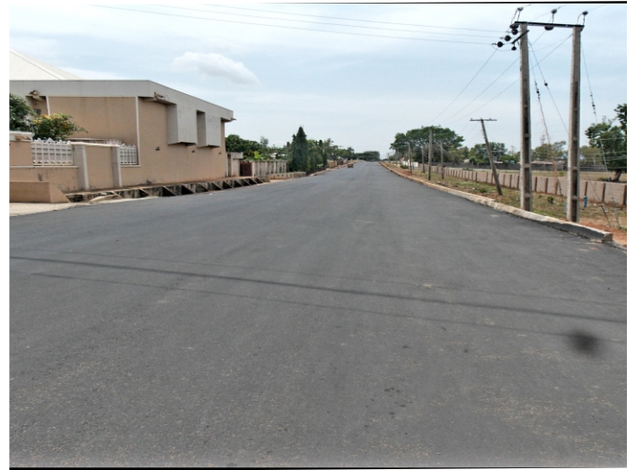
MAFIA QUATERS ROAD AFTER