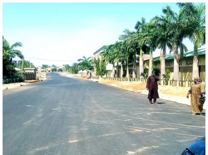
ZUMO ROAD AFTER