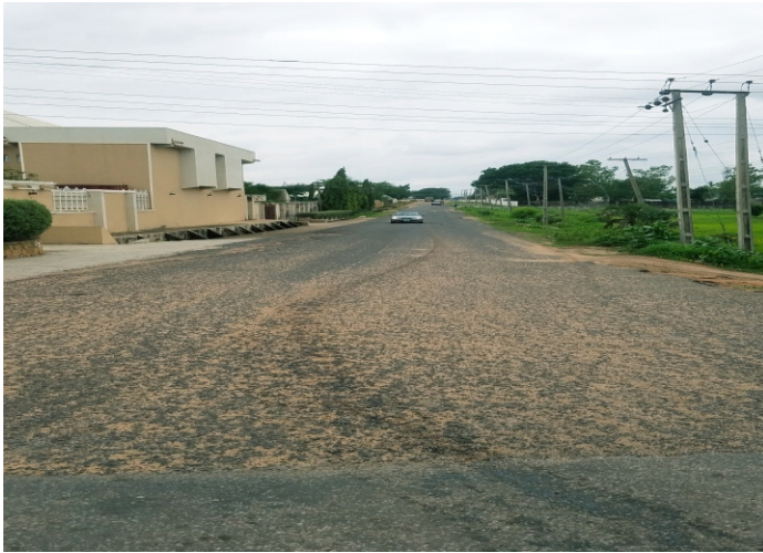
MAFIA QUATERS ROAD BEFORE