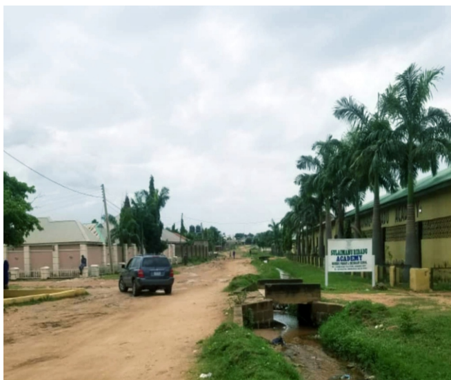
ZUMO ROAD BEFORE